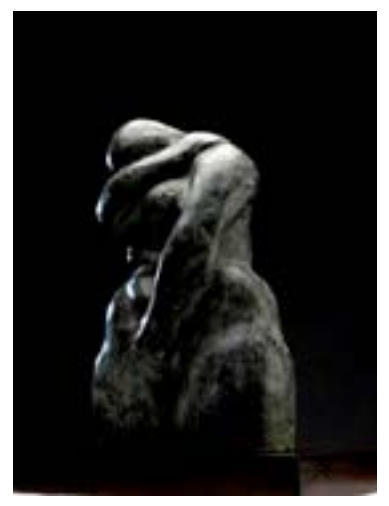
Head & Torso