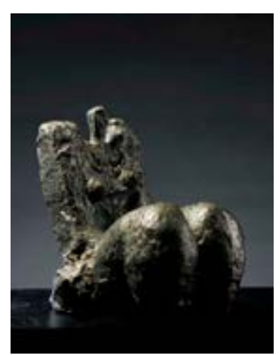
Queen relaxing 1986