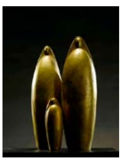
Sun Worshippers 1975