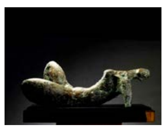
Fallen Woman 1970

"In my recent experiments in sculpture, through a chance happening I hit upon the idea of making Instant Sculpture in a matter of a few minutes or even seconds. I made it a point to keep my mind blank and thus have the intuitive approach instead of the intellectual, by way of playing with a lump of clay without having any preconceived notion. In the process of the action? squeezing, twisting, rolling, flattening, pinching etc. suddenly a beautiful form emerges, sometimes in a very realistic fashion, sometimes in a near-abstract form giving certain clues of verisimilitude? a composition with human, animal or bird form. The interplay of gliding forms, one merging into another or one emerging from the other creates a sense of rhythm."